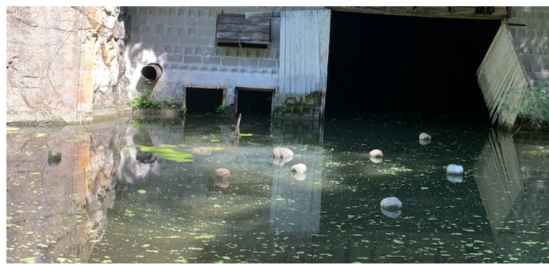
Renata Del Riego If rocks had no memory they would probably float