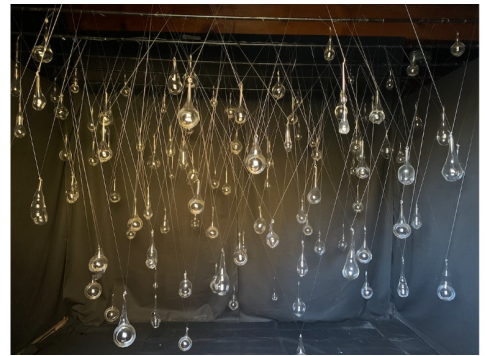
Laura McCallum - Mystère