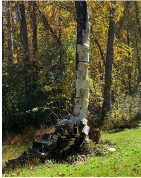
The Center for the Relationship Between Words and Stone - World Politics