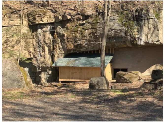
There's a new storage shed by the mine entrance so we don't have to haul things to the barn and back all the time.