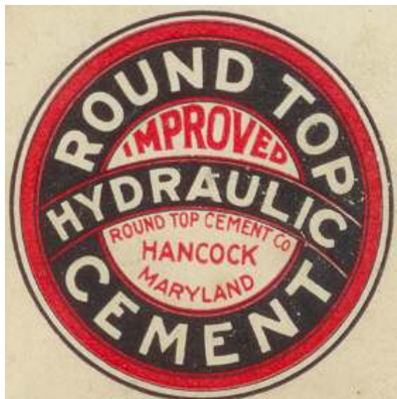
Round Top Cement Co. Logo 1905