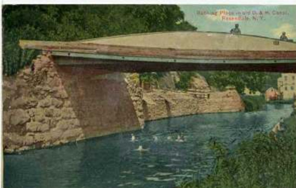
Rosendale Bathing Place D&H Canal west end of Main Street 1905 post card

Now it seems that many homes have a pool in the backyard. But the backyard pools need to be filled each summer. The Turco Brother's Water Company, which draws water from an abandoned cement mine, does just that. Water formerly pumped out so mining could continue now is pumped into large tanker trailer trucks and delivered to fill those backyard swimming pools [DEW]