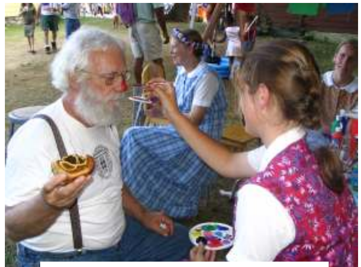
Witness Protection Plan — before