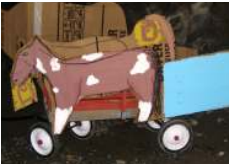
Mules pull wagons loaded with stone from the Widow Jane Mine