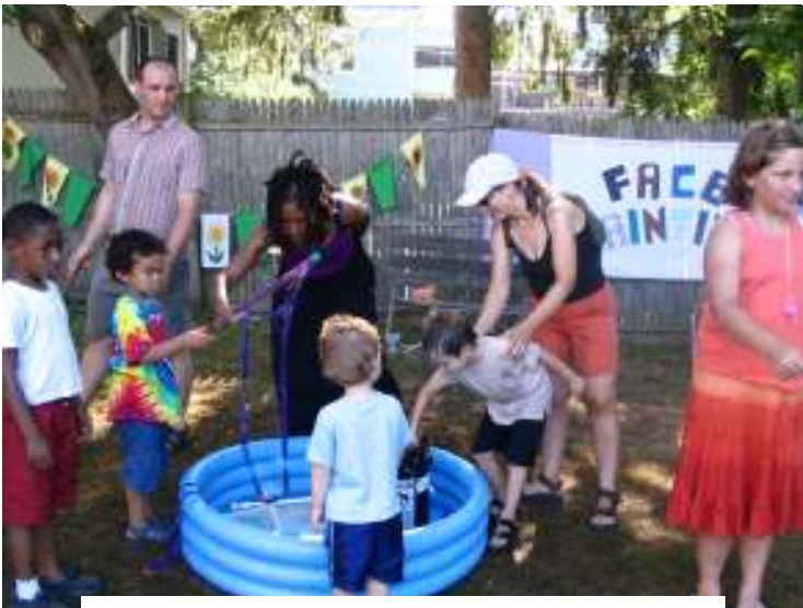
Ma, what's in there?