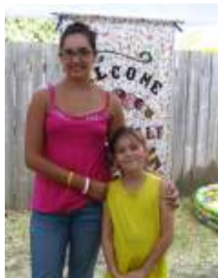
Short & tall, volunteers all