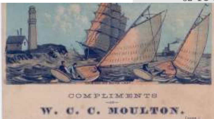
"Scrub Race of Boston Light"

The business had moved from Derby St. to Central St. In addition to Cement, Lime and other mason's materials Moulton added butter, cheese, eggs, and other farm produce to the list of items sold. The sale of cement and other seemingly unrelated items like eggs and cheese or even cement and drugs was common practice. [DEW]