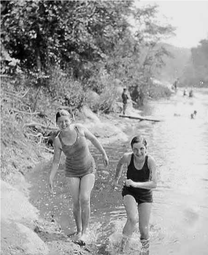
Rondout Swim , July 1929