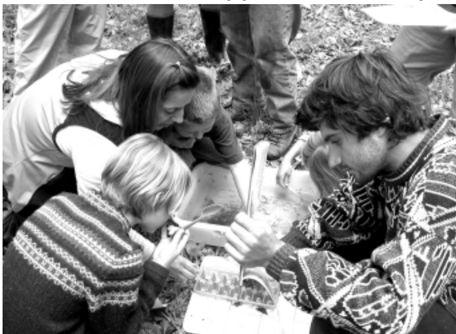
Care Taker's separate specimens taken from Tan House Brook

With magnifying glasses and sharp eyes the bugs were compared to drawings on pamphlets handed out to each "water tester"...then the job was to identify whether it was a mayfly, stonefly, caddis fly, riffle beetle, damselfly, dragonfly, scud, sow bug, beetle larva, black fly larva, midge, crane