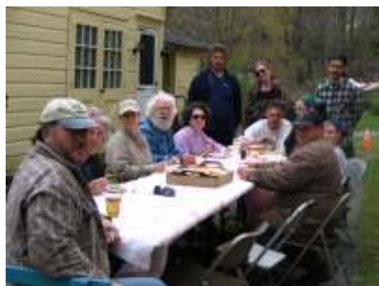
The real reason why folks show up for Spruce Up Day?