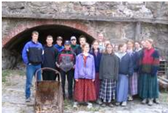
This year's first school visit was by students from the Bruderhof who visited the Snyder Estate to learn about the geology and history of the Rosendale Natural Cement Region.