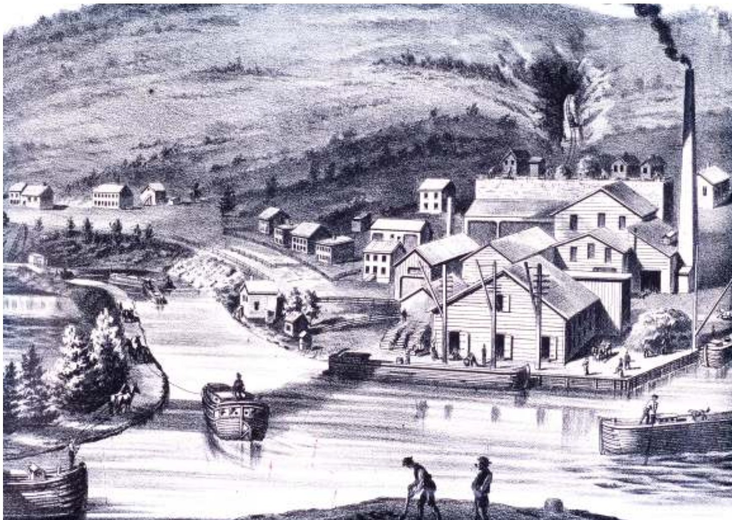
The New York Cement Company at Rock Lock, LeFever Falls, New York Beer's Atlas of Ulster County 1875

Those were the headlines not only of the local press, The Weekly Freeman and the Kingston Argus, but of big city newspapers like the New York Times. The Rondout Courier was the first to report on the dispute. The New York Times, in its September 8, 1878 issue, followed with a front page story, based on the Courier's report. The Weekly Freeman followed with a story on the 13th and the New York Times revisited the story with additional information on the 22nd. The story was picked up by the Associated Press and appeared in many papers throughout the United States that subscribed to the AP service. Even now, 127 years later, these reports make for interesting reading. Four of newspaper accounts are reproduced for your reading pleasure.