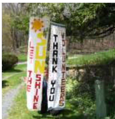
Gayle's banner calls for a sunny day for Spruce Up Day