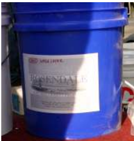
5 gal [47 lbs] Bucket of Rosendale Natural Cement